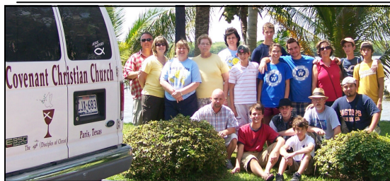
3rd Annual CCC Family Mission Trip

My admiration for great writers, who can make words on a page come to life, grows as I try to take life and put it on a page. We are truly living in unbelievable days in Burgos. God's presence, power, and love seem to be waiting for us around every corner. With wide eyes and wonder, we wait for what God will do next.