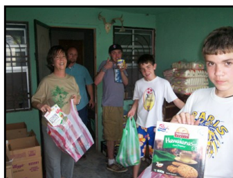
(Left to right) 1. Youth painting our house as part of our rental agreement with landlord. 2. Backyard party at our house hosting neighborhood children. 3. Organizing 154 bags of food to be distributed later to children in the Child Sponsorship Program.

For the second year, youth from Covenant Christian Church in Paris, Texas came to Burgos during their spring break to do work projects, minister to children, and enjoy the people, places, and food of the region. CCC continues to grow its relationship with the families of Burgos and surrounding communities. Children have come to know several of the youth and adults and look forward to their two annual visits. Much was accomplished during the trip. Highlights included painting our house and office, organizing food distribution, hosting a children's party, visiting area communities and sponsored children, and a quick trip to the beach.