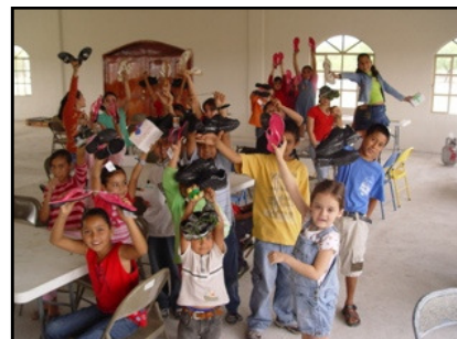
75 Children received shoes from their sponsors. Weekly children's programs are underwritten by the general giving of our partners.