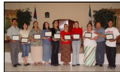
12 Bible College Students (all on scholarship) received certificates for completion of 3 trimesters (96 hours)