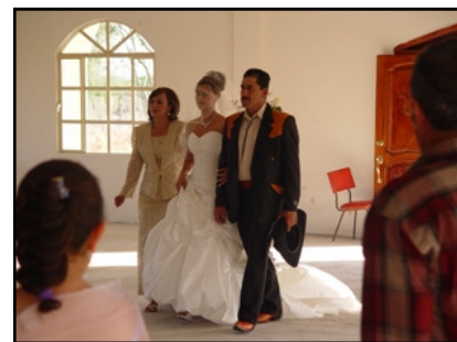
The church facilities of Cristo es la Roca are being completed with funds from partners. The church hosts several regional events and ministers to the community in many ways; such as this spring wedding.

BURGOSmissions raises its own support through family and friends who wish to be a part of the ministry taking place in this region of Mexico. A "grass roots" ministry, the work has been blessed with growth in its beginning years thanks to the mercies of God and generous partners.